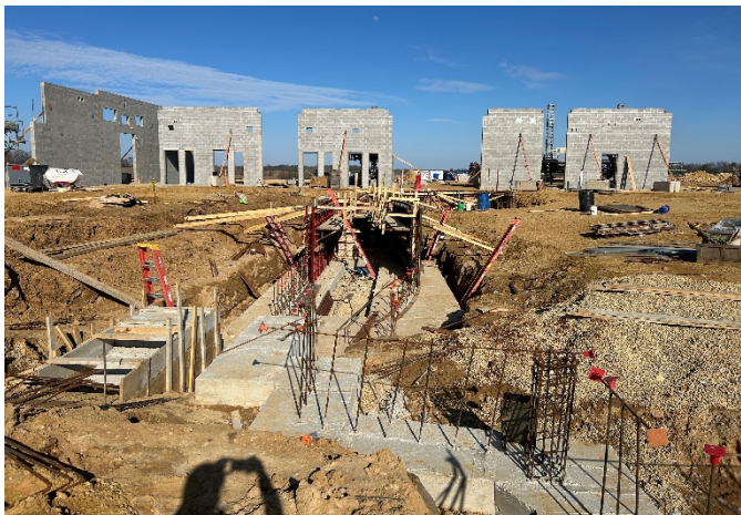
Forming, Pouring & Stripping Orchestra Pit Walls