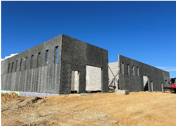
CTE Expansion Precast Panel Install