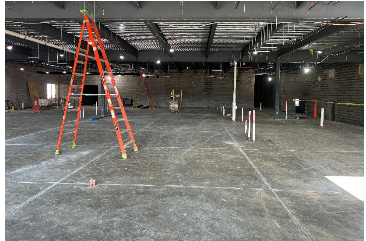
Slab on Grade Finish Work in the Administration Space