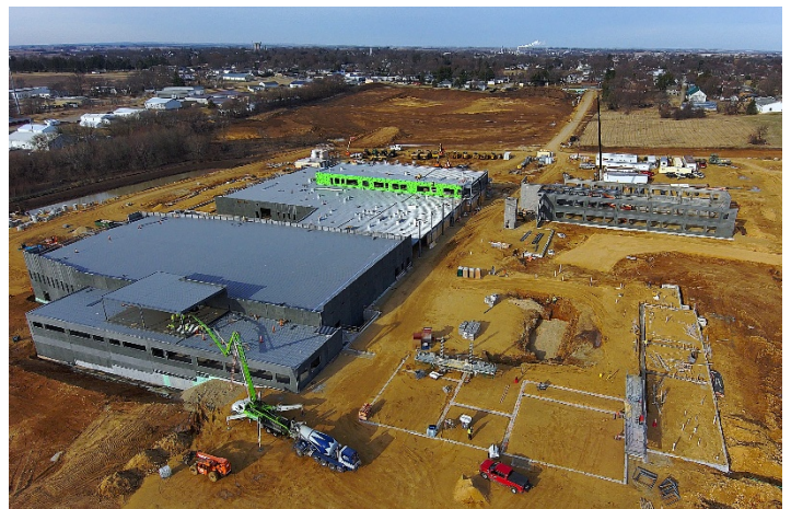
Building Footprint Aerial View – Picture Dated 3/21/25